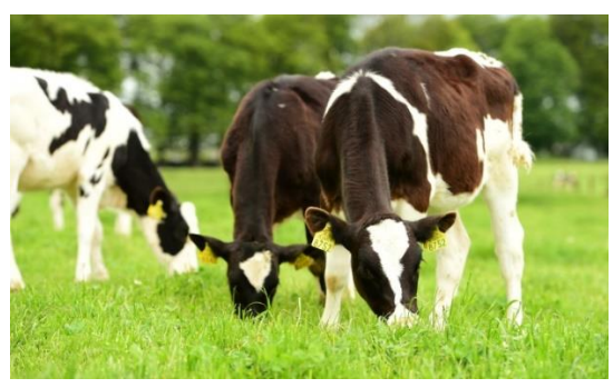
Picture 1: Grazing dairy heifers (Photo: Margie Egan, Teagasc, Donagh Berry).