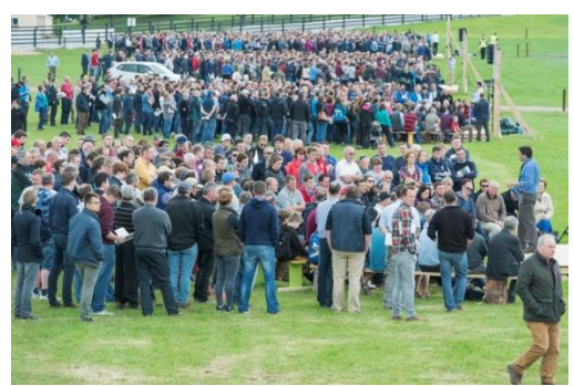
Picture 2: Dissemination of how to use the COW index to 10,000 farmers.